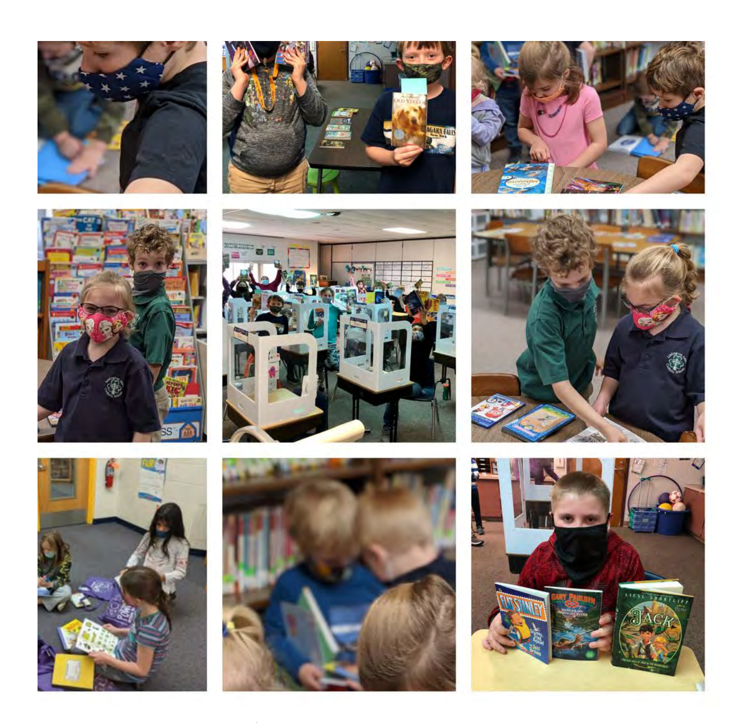
"Thank you for everything! Your work changes lives." Mother of a recipient of the School Book Give-Aways